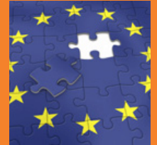
Architecture & Interoperability